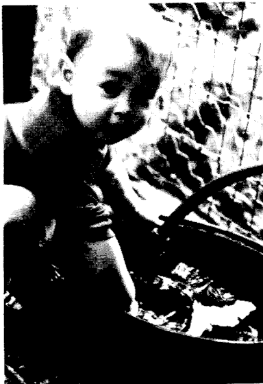
My grandson the splasher

More than likely, nursing has provided strong protective factors. Breast milk contains gamma-linolenic acid (GLA), an Omega-6 fatty acid that produces soothing, anti-inflammatory prostaglandins. Several medical studies show that GLA, given in the form of evening primrose oil, improves eczema in adults and children. *